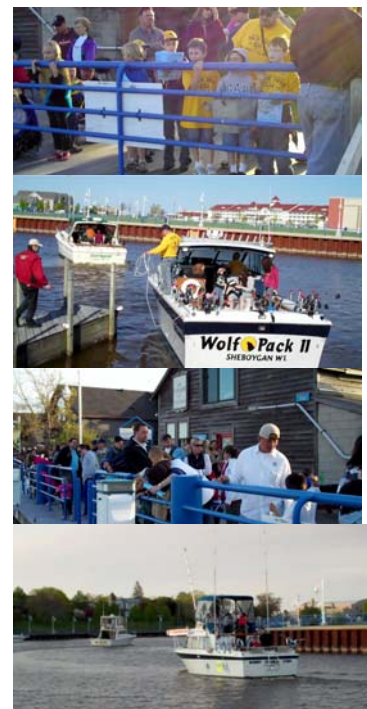
Join the fun! Free boat rides & refreshments on the Boardwalk