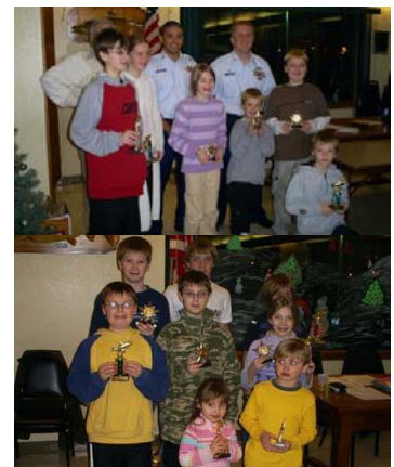
Come support our kids big fish awards night!